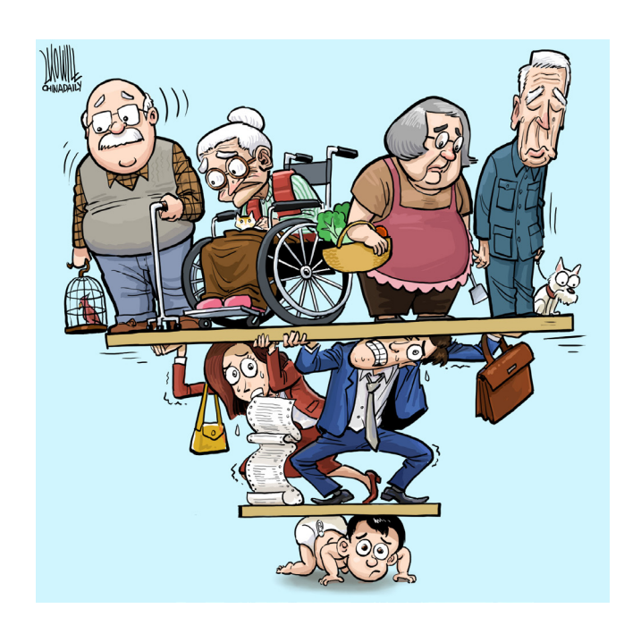
Copyright © Luojie, 2013 (Cagle Cartoons)